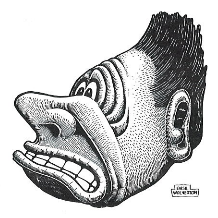
"Gulp! The minister saw me come in late again!"

that we are expected to do is attend the Sabbath services. In order to really be profitable we have to go beyond the minimum requirement. We need to be regular in Bible Study attendance. We need to study before we come to the Bible Study so we can ask intelligent and helpful questions. We need to teach our children to respect the place where we meet — teach them that God has placed His name there.